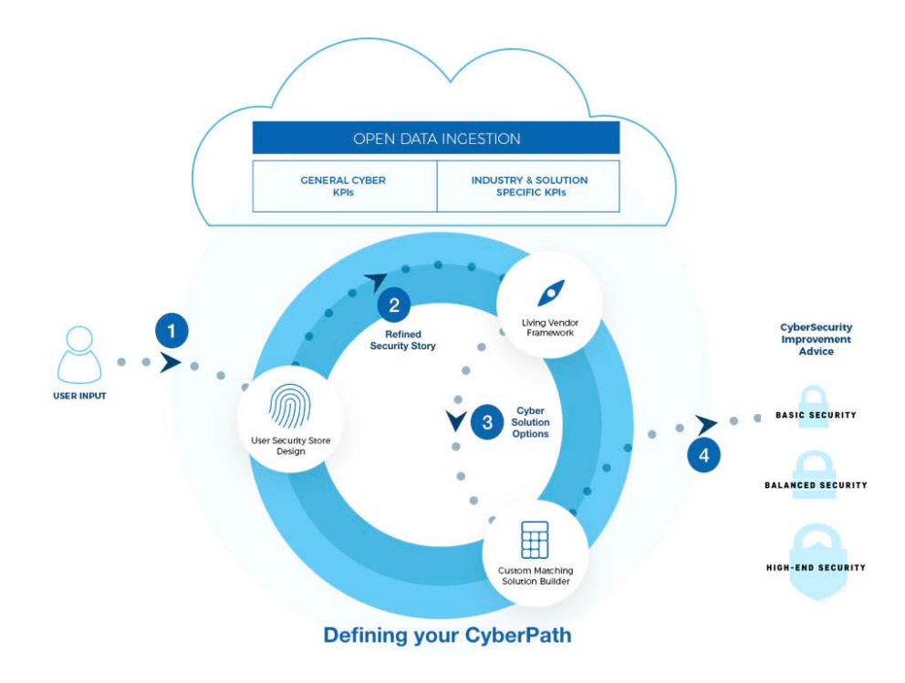
Figure 2: Technical approach to the CyberPath Solution Engine

The CyberPath Solution Engine leverages machine learning and advanced patent-pending algorithms to build a customer tailored Cyber Risk Profile and: