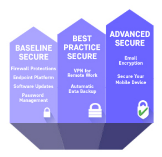
Figure 4: CyberPath Solution Engine results

Becoming Baseline Secure or achieving 'The Basics' in cybersecurity is about enabling everyday internet users to understand what is most important and to use foundational and proven security protections while interacting online, which immediately raises prevention and mitigation levels. Baseline solutions allow customers to 'lock doors and windows', making it just difficult enough for most run-of-the-mill cyber criminals to be deterred or prevented from accessing private data. Baseline security focus areas include: